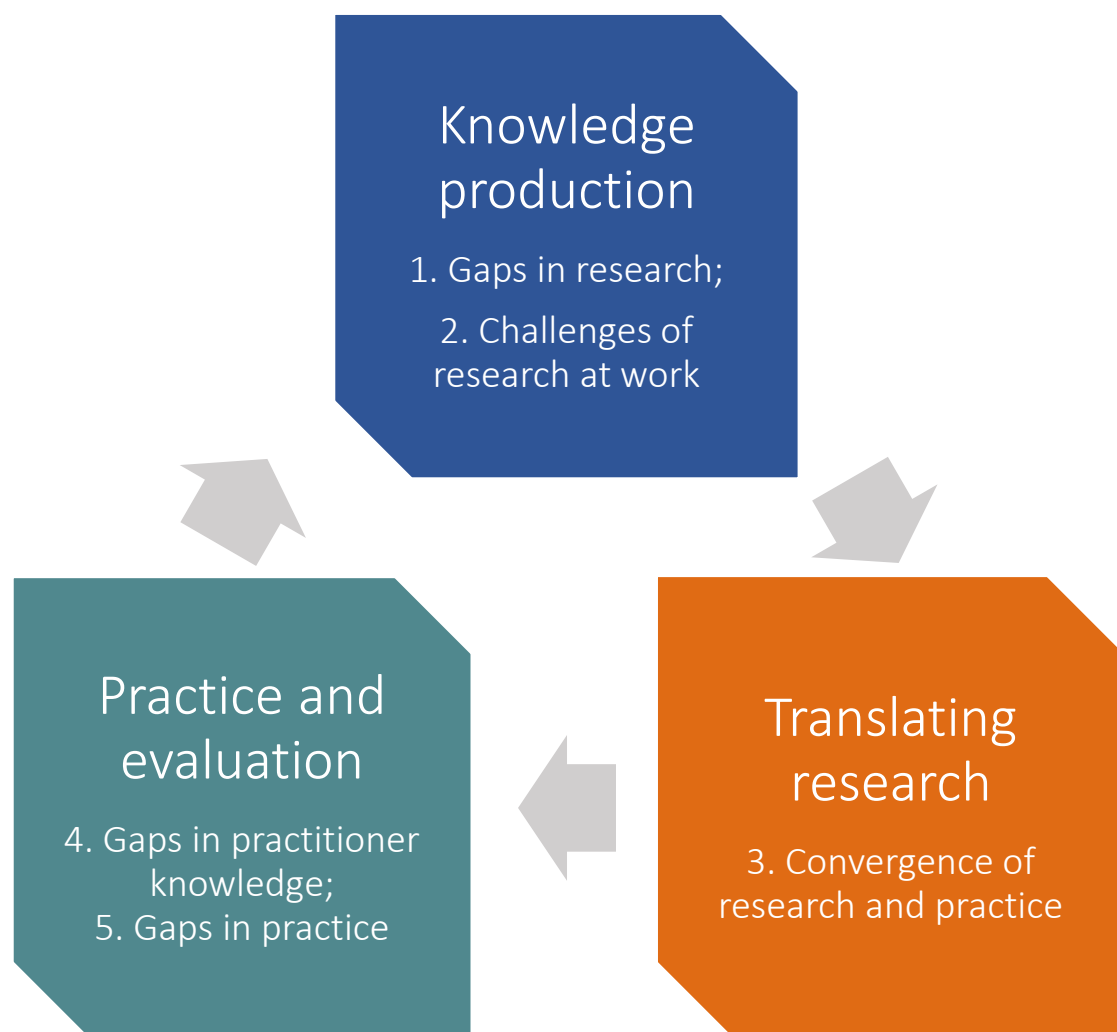
Figure 1. Knowledge creation-translation cycle

Below we discuss the five main themes underlying the knowledge creation cycle depicted in Figure 1.